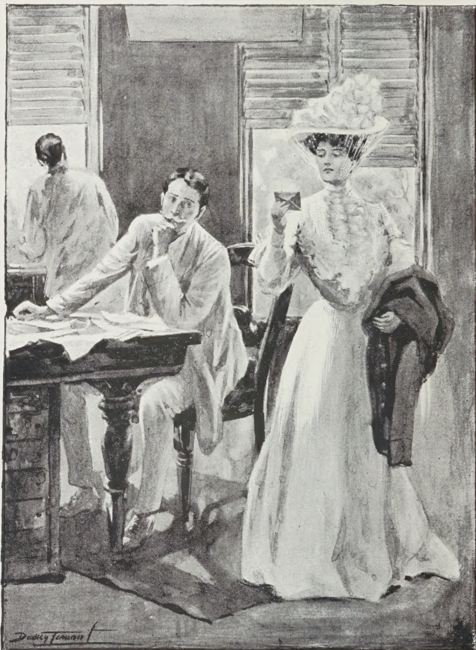
She stood looking in an embarrassed way at the address on the envelope.